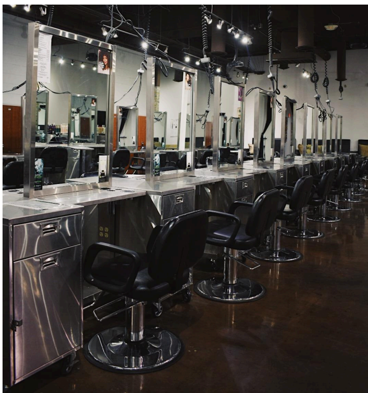
Aveda Institute Las Vegas Student Cosmetology Clinic Floor

Students are introduced to prospective employers during career fairs and learn interviewing skills and other social skills required in the beauty and wellness fields.