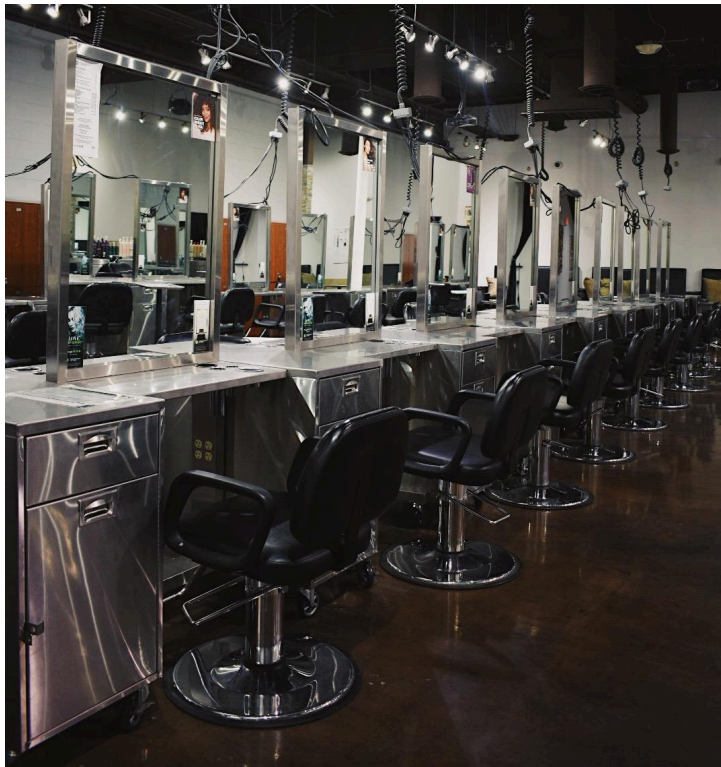
Aveda Institute Las Vegas Student Cosmetology Clinic Floor

Students are introduced to prospective employers during career fairs and learn interviewing skills and other social skills required in the beauty and wellness fields.