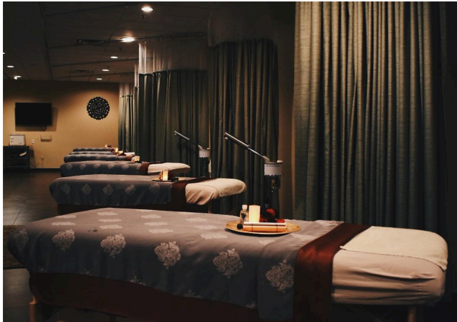
Aveda Institute Las Vegas Student Esthiology/ Advanced Esthetics Clinic Floor

*Students with a Felony must be cleared and approved for licensure with the respective state board prior to start date.*