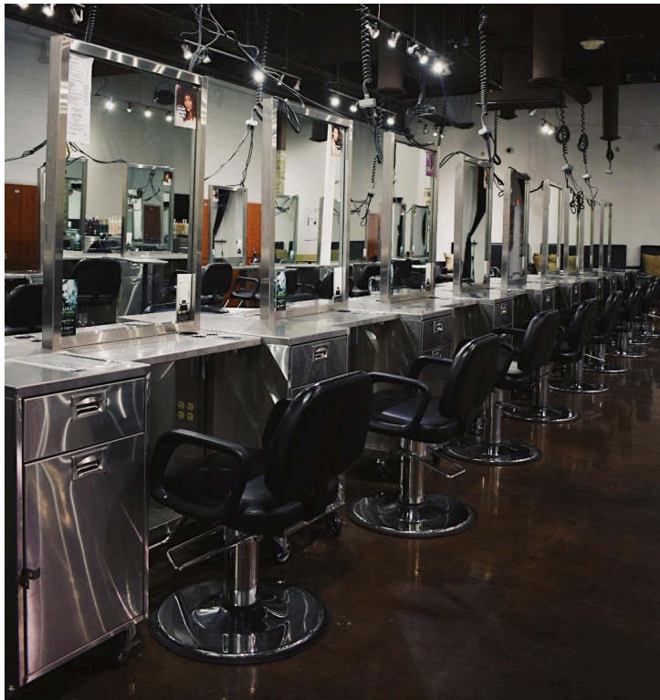
Aveda Institute Las Vegas Student Cosmetology Clinic Floor

Students are introduced to prospective employers during career fairs and learn interviewing skills and other social skills required in the beauty and wellness fields.