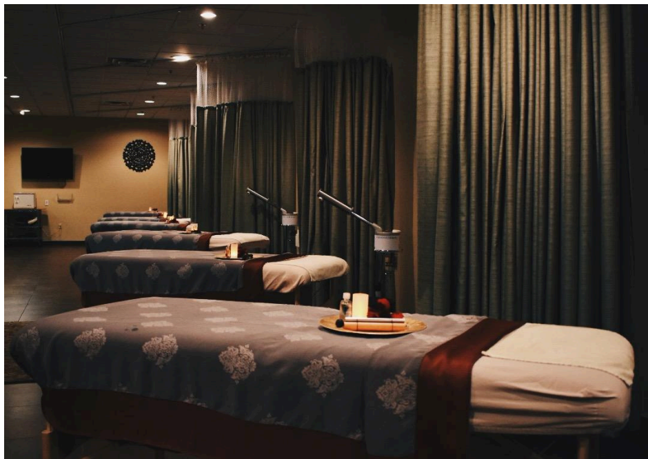
Aveda Institute Las Vegas Student Esthiology/ Advanced Esthetics Clinic Floor

*Students with a Felony must be cleared and approved for licensure with the respective state board prior to start date.*