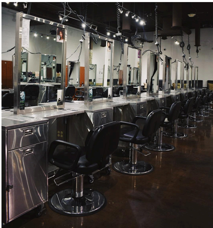
Aveda Institute Las Vegas Student Cosmetology Clinic Floor

Students are introduced to prospective employers during career fairs and learn interviewing skills and other social skills required in the beauty and wellness fields.